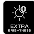
Extra Brightness 2)

Vibration resistant, environmentally friendly, and cost-efficient