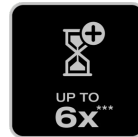
Up to 6 times longer lifetime 3)

Construction, dimensions and mechanical compatibility inspired by traditional lamps. For easy and quick installation.