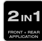
2 in 1: Front and rear application

Matched to individual requirements and needs for versatile applications