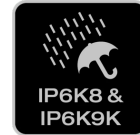
IP & IK protection classes

Matched to individual requirements and needs for versatile applications