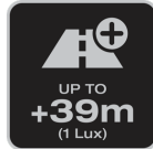
Up to 39 m long beam

For a large-area and wide light distribution