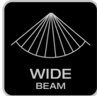
Wide Beam Pattern

For a large-area and wide light distribution