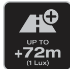
Up to 72 m long beam

For a large-area and wide light distribution