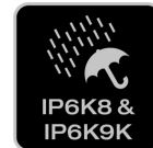
IP & IK protection classes

Matched to individual requirements and needs for versatile applications