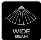
Wide Beam Pattern

For a large-area and wide light distribution